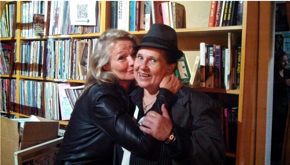
There was smooching... and ...