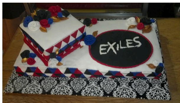
And there was cake!