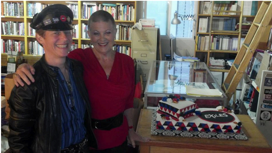
Even after the pain, best friends again!

Everyone got a raffle ticket at the door, and some purchased more tickets once they saw the array of fine prizes, including bondage rope, floggers, whips, sex toys, and even an autographed video from Cleo Dubois.